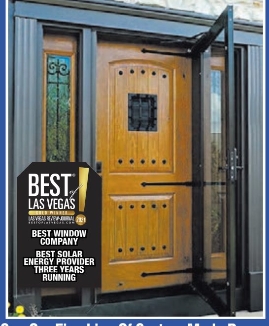
See Our Fine Line Of Custom Made Doors.