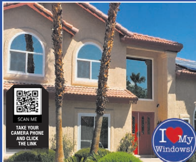
Extreme Plus Super Glass Package Now Available!