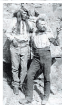
John Wesley Powell led 10 men down the Green River in 1869 to begin a journey that would take him through the Grand Canyon.